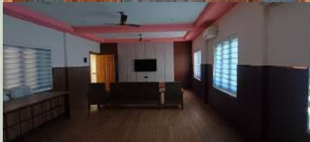
A Renewed Devdarshan: Interiors of the CMI Provincial House